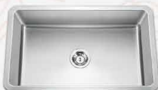
ITEM: U301-25 - 30 INCH (1+) PRICE: $70.00